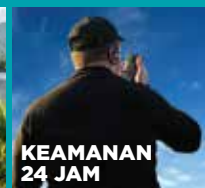
KEAMANAN 24 JAM

Jl. Raya Parung No. 27 Bojongsari Lama Sawangan - Depok