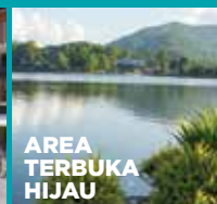
AREA TERBUKA HIJAU