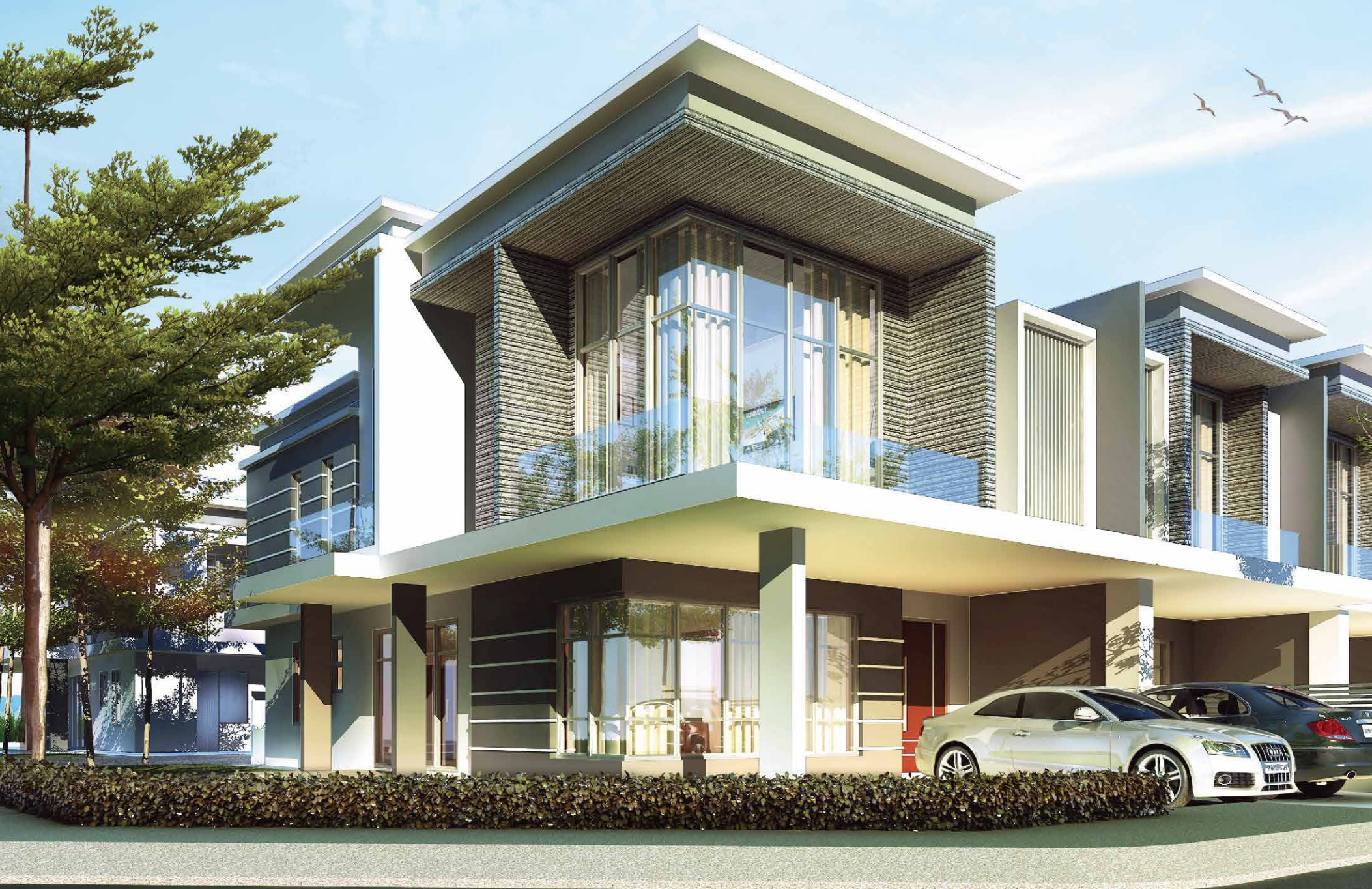
Artist impression only

land area: 24' X 80' ■ built-up: from 2,700sq.ft.